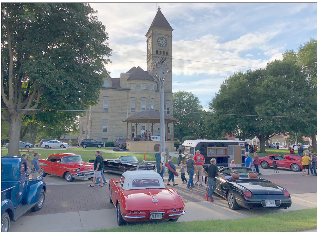
The courthouse square will be a hub of excitement this summer, as the Rock Around the Clock Tower car cruise and concert series is set to kick off on Thursday, June 20.