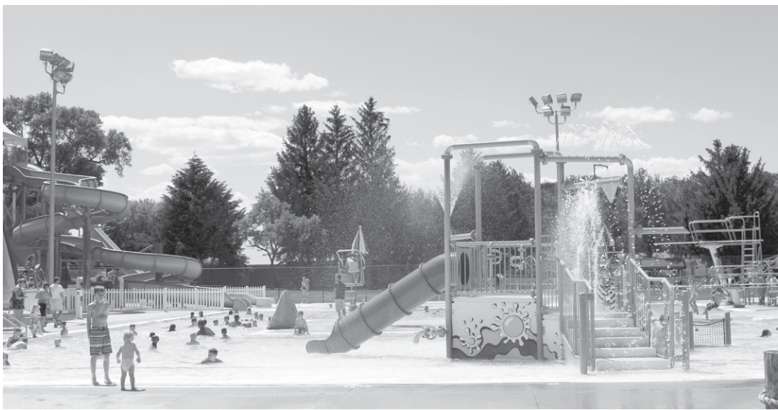
So far, the Grundy Family Aquatic Center has had a busy first week, as kids and families head to the pool to soak up the sun this summer.