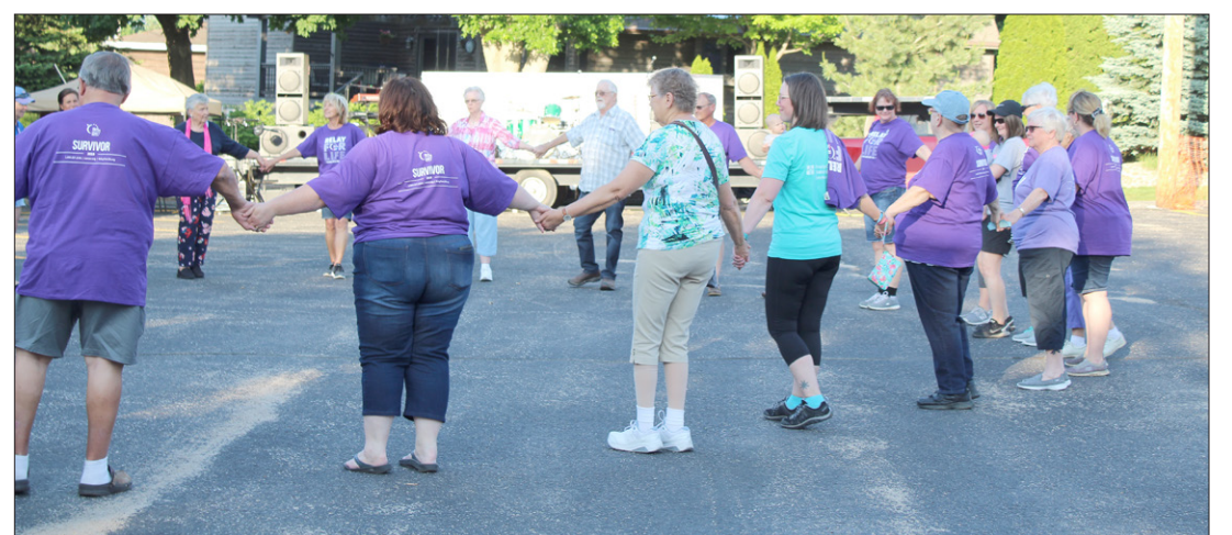
Cancer survivors gathered together in a circle during this year's Survivor Ceremony at the Grundy County Relay for Life in Reinbeck. More photos on page 9.