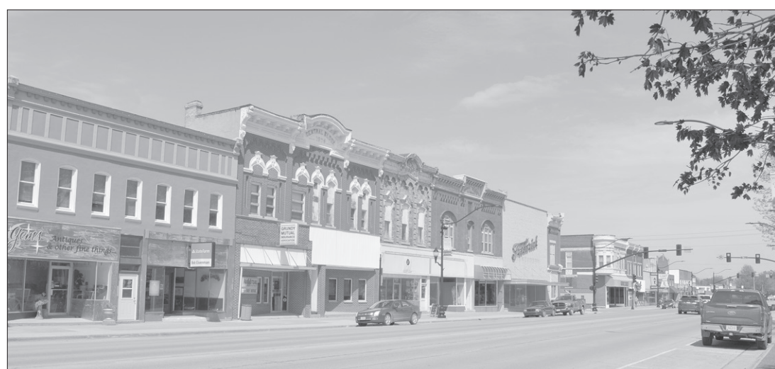
A recent survey conducted by the Grundy Center Chamber-Main Street has helped identify areas of need and opportunity in the downtown business community.

Report such calls to your local law enforcement agency.