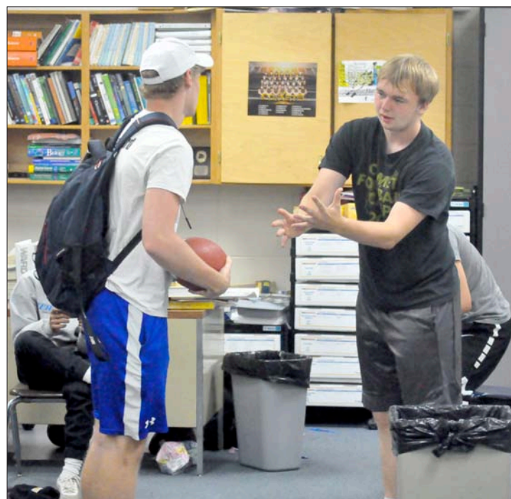
Members of the "Ultimate Health" class toss the football around.